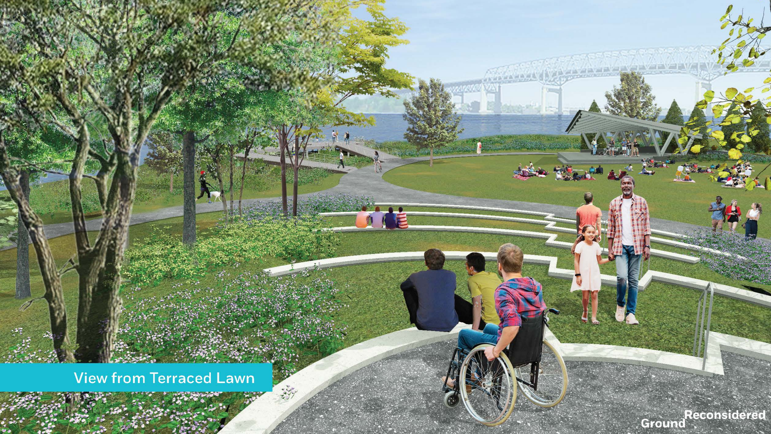
View from Terraced Lawn